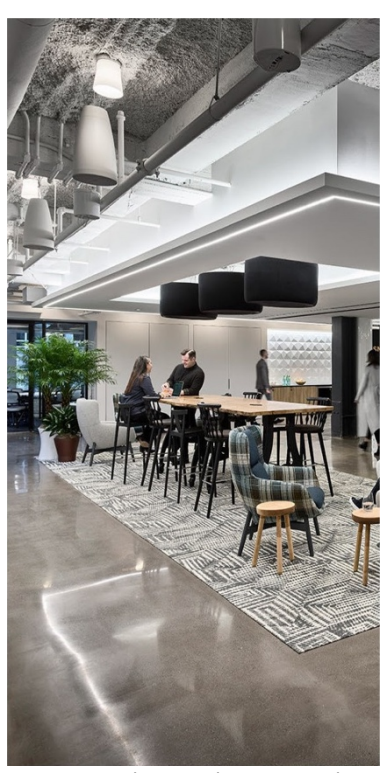
exposure by industry and

The portfolio seeks to maximize risk-adjusted returns and diversify